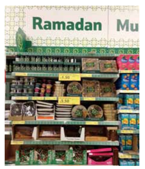
A leading British supermarket stocks up for the holy Muslim month of Ramadan.

Worse are assumptions that all British Muslims are Asians, and the only products they want are chicken tikka pizzas and prayer mats. These