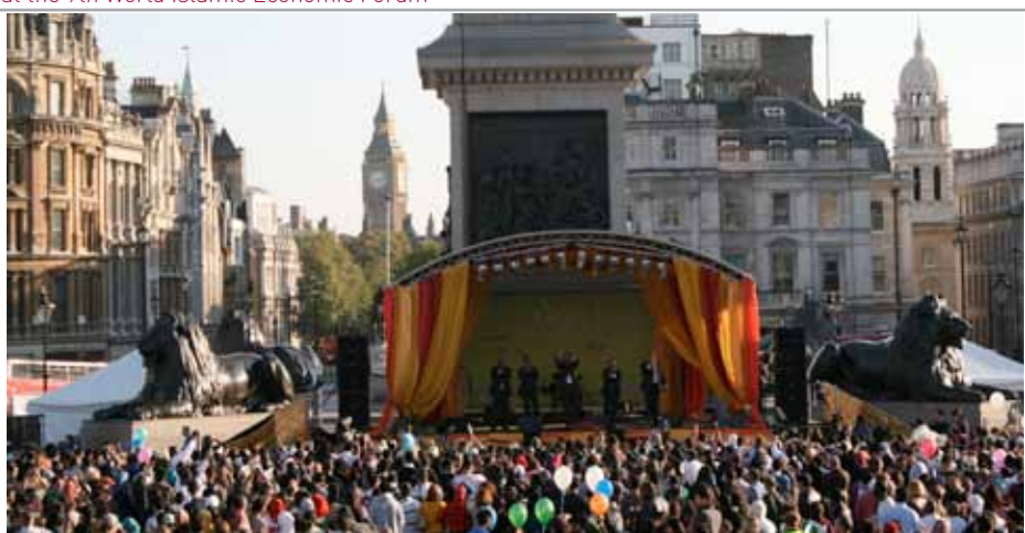
Londoners of Muslim and other faiths celebrate 'Eid in the Square' in 2007, organised jointly by the Muslim Council of Britain and the Mayor of London.