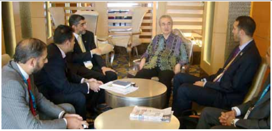
Members of the MCB Delegation meeting H.E. Abdullah Badawi, former Prime Minister of Malaysia at the 8th WIEF