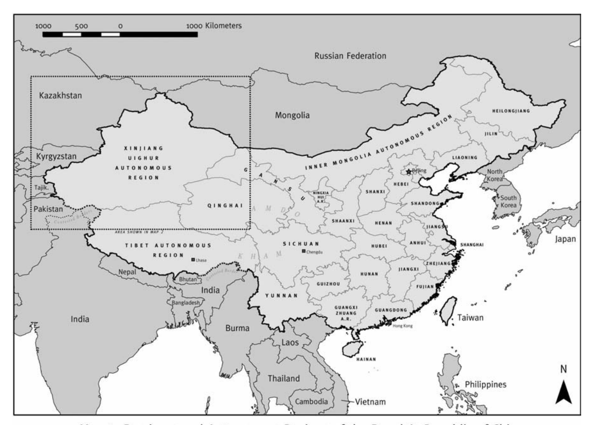
Map 1: Provinces and Autonomous Regions of the People's Republic of China